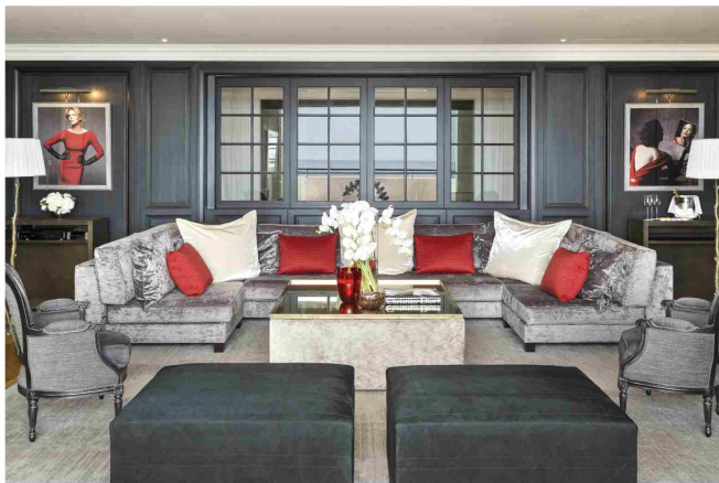
Hotel Barrière Le Majestic Cannes