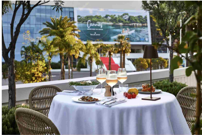
Hotel Barrière Le Majestic Cannes

As are the bars and restaurants and its numerous and accomplished chefs and mixologists. Head Bartender Emanuele Balestra, who maintains two on-site gardens of 70 plant species to use in his concoctions, and has “unique, scientific methods for inventing aromatic cocktails including the use of an industrial-grade rotary evaporator, and even an ultrasound machine.