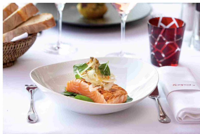
Hotel Barrière Le Majestic Cannes