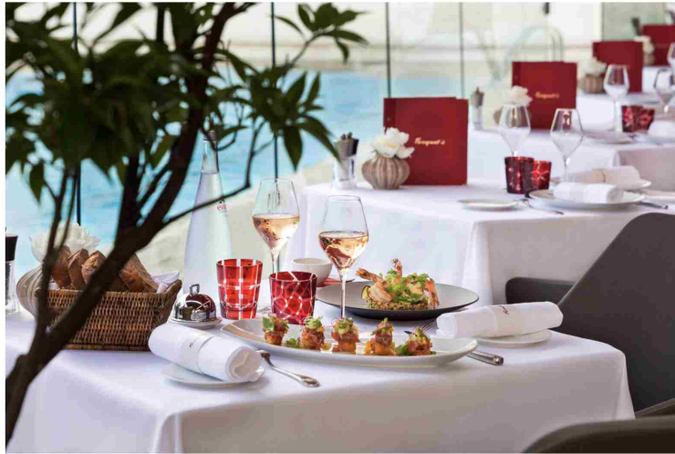
Hotel Barrière Le Majestic Cannes

And then there's Fouquet's Cannes, outpost of Fouquet's in Paris, one of the world's most famous restaurants, located in Le Majestic owner Groupe Barrière's Hotel Barrière Le Foquet located just off the Champs-Élysées. Both locations of the 120-year-old brasserie, famous for its celebrity clientele, are helmed by 3-Michelin-star Chef Pierre Gagnaire.