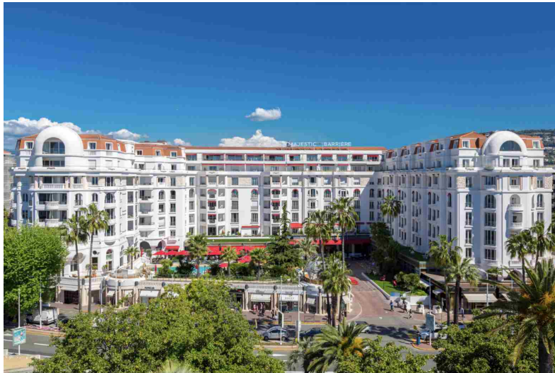
Hotel Barrière Le Majestic Cannes

The Hotel Barrière Le Majestic Cannes is a favorite of celebs who attend the seaside resort's annual film festival.