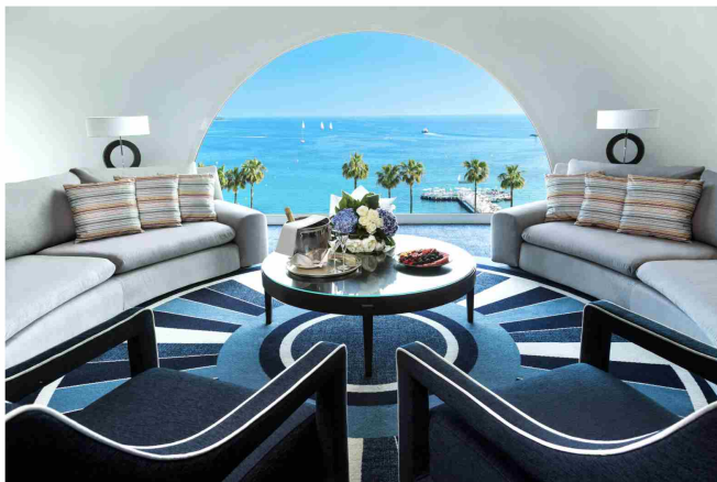
Hotel Barrière Le Majestic Cannes