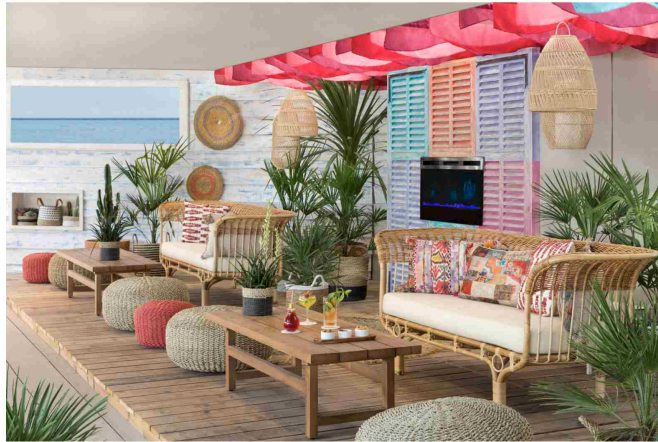
Hotel Barrière Le Majestic Cannes