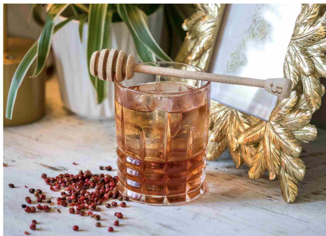
Hotel Barrière Le Majestic Cannes

And the top draw of all is Le Majestic's private cinema, Cinémathèque Diane, which can now also screen 3D films, with many events held there and in the various private function and dining rooms. During the Festival the hotel typically goes through two tons of lobster, 110 pounds of caviar, 750 pounds of foie gras, and 18,500 bottles of wine, more than half of it champagne.