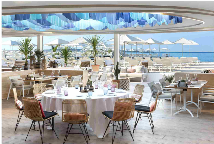
Hotel Barrière Le Majestic Cannes